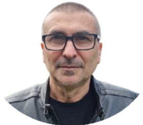
Marian Pintilie Romanian Fellowship